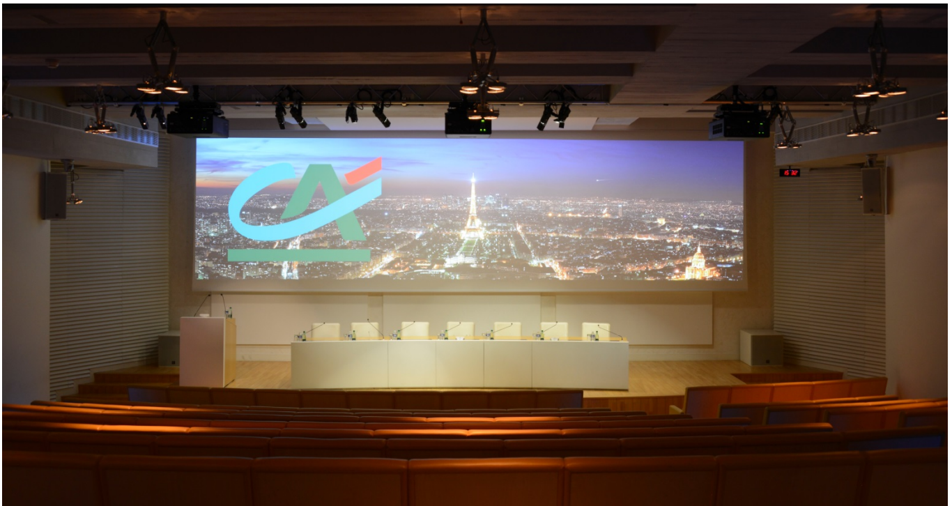
The main auditorium at the Fédération Nationale du Crédit Agricole

There are some projects that would not have been achieved without perfect synergy between the various stakeholders. The modernization of the AV system of the Fédération Nationale du Crédit Agricole (FNCA) , one of the biggest French banking groups, is the prime example.