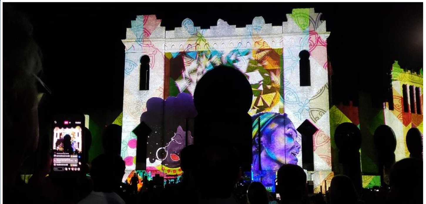
Projection mapping driven by Picturall Pro Plaza de Toros in Colonia (Uruguay) - Congress Rental