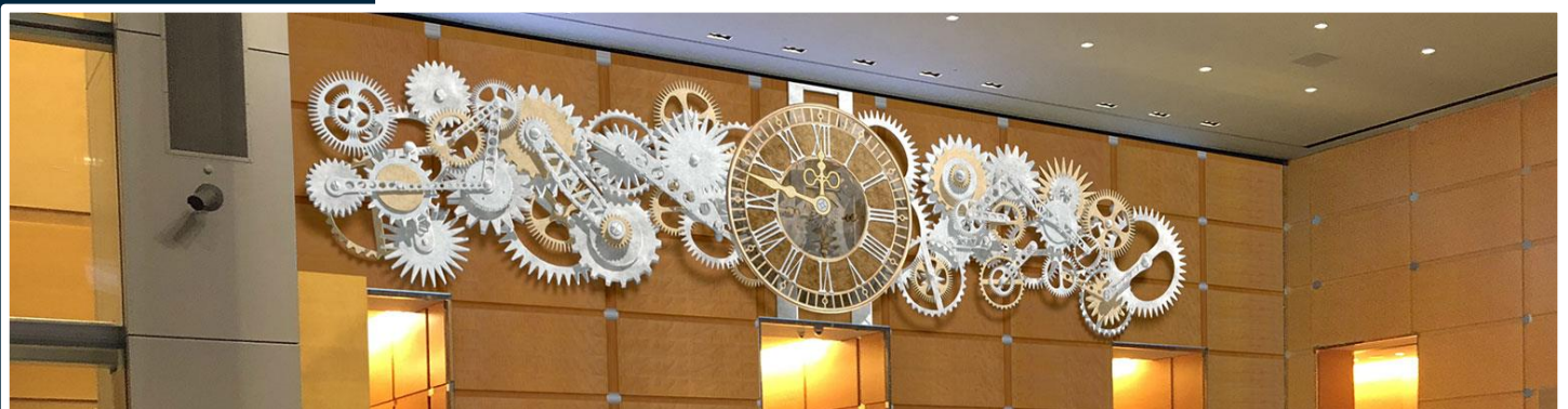
27 million pixel LED videowall driven by Picturall Pro and Aquilon The Comcast Experience (USA)