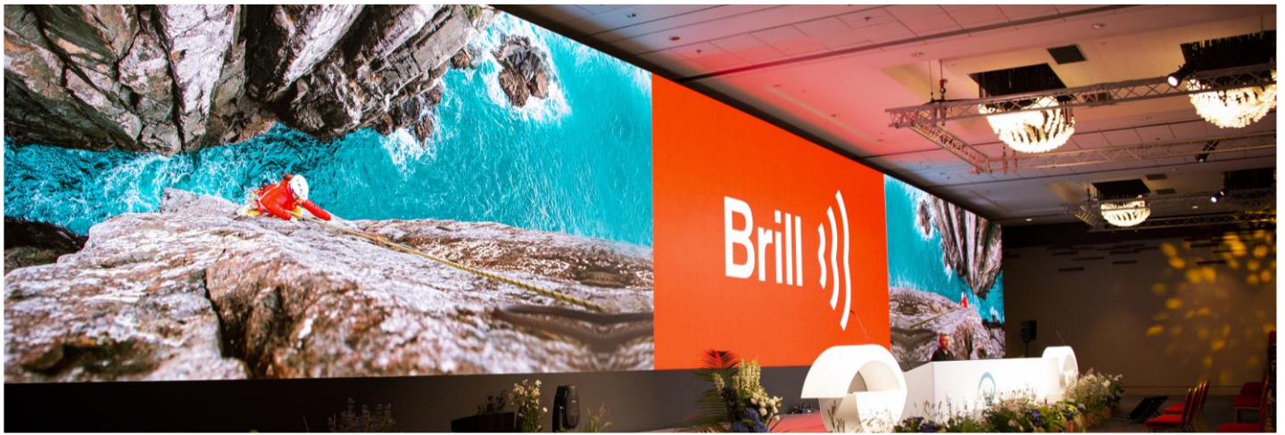
17 million pixel LED videowall driven by Picturall Pro and Aquilon Annual Summit of Experts (Paris, France) - Brill Audio Visual Ltd